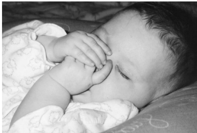
... Speak no evil