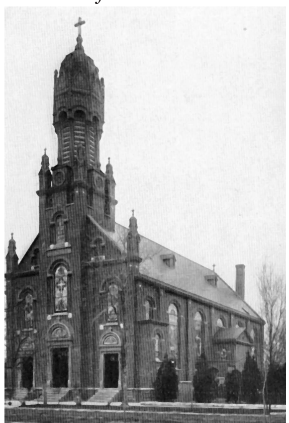
St. Anthony's Parish in Wichita, Kansas, founded in 1887

"A bishop is the chief shepherd of a diocese."