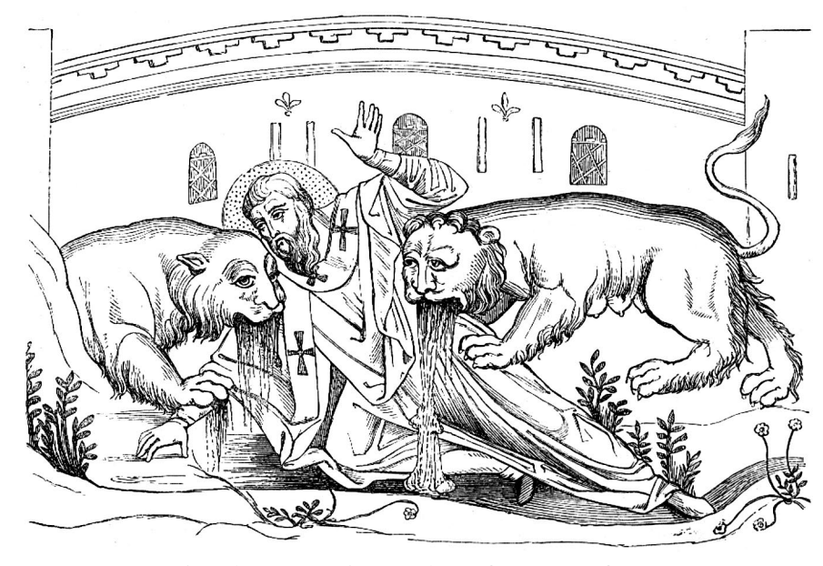
Martyrdom of St. Ignatius, drawing after a 9th century Greek manuscript

BORN 50; DIED ABOUT 107 BISHOP AND MARTYR FEAST DAY: OCTOBER 17