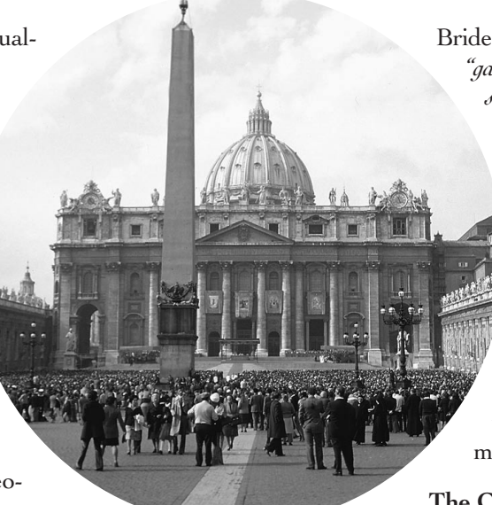
The largest church in the world, St. Peter's Basilica in Rome, constructed from 1506 to 1615