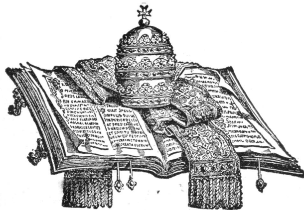
Papal crown and stole on the Sacred Scriptures: The Church discerned which books were inspired by the Holy Spirit

Like all things but sin, infallibility is a gift from above. It has its source in the divine life of the Holy Trinity. In concrete form, it has been revealed in the person of Jesus of Nazareth, who is the eternal Son of God made man (see Jn 1:1-2, 14), and who “desires all men to be saved and to come to the knowledge of the truth” (1 Tm 2:4). Jesus Christ is “the image of the invisible God” (Col 1:15), the reflection of God’s glory (see Heb 1:3), “full of grace and truth”