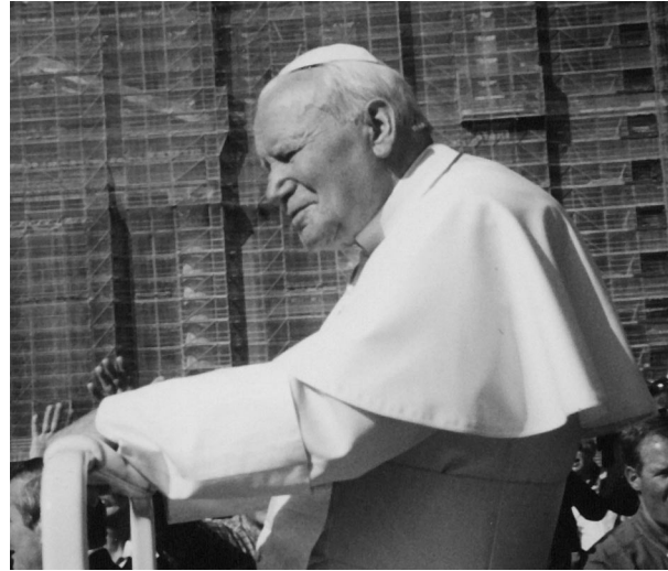
Pope John Paul II, reigned from 1978 to 2005

A primary objection raised by this truth is the reality of weakness and sin. It is said that, given the notorious sins of certain popes, it is clear that infallibility does not exist. Yet the charism of infallibility is not a question of personal holiness. It is a question of teaching. It is a question of the Holy Spirit who will not let the Church sink into error regarding faith and morals. Popes may reject in their own personal lives both faith and morals, but they will never be given over to teaching as true what is actually false. It is worth noting that no pope in history has even attempted to make an infallible statement justifying his own sins or the sins of others, or to satisfy some whim or fancy.