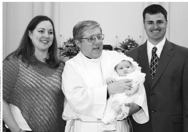
Priest and parents celebrate a newly-baptized child

There is a close relationship between the gifts of the Holy Spirit and the human virtues of prudence, justice, fortitude, and temperance (see handout on Virtuous Living). The gifts of the Holy Spirit give supernatural value to the human virtues, completing and perfecting them. Understanding, counsel, and knowledge help us see the spiritual value of things, an aid to the virtue of prudence. Piety is related to justice, which renders to others what is due them. Piety gives to God the love and obedience that is due him just because he is our God and is infinitely lovable and deserves our obedience. Fortitude is obviously directly